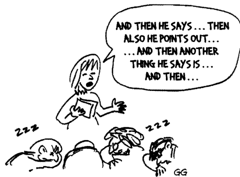
THE EFFECT OF A TYPICAL LIST SUMMARY